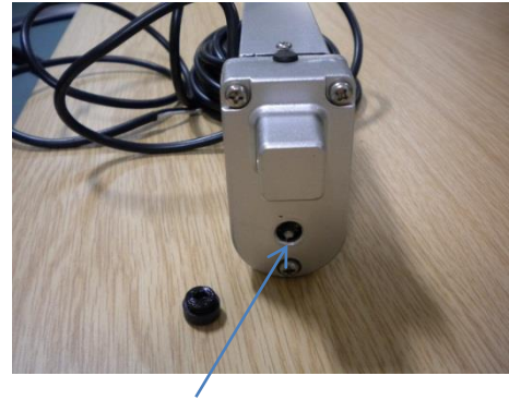
MANUAL RELEASE DRIVE SPINDLE