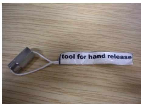
Hand Release Tool