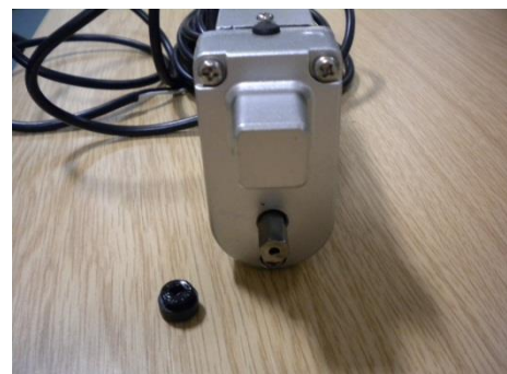
Hand Release Tool engaged onto drive spindle